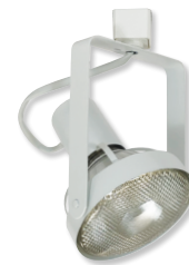
NTH-148W/A White Finish