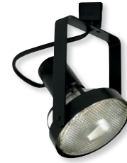
NTH-148B/A Black Finish