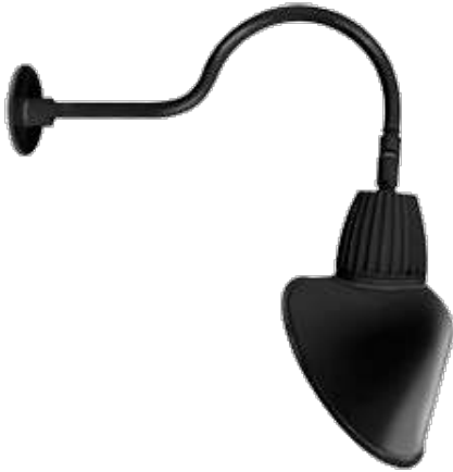
13 & 26 Watt Angled Cone Shade LED Gooseneck Luminaire designed to match the architecture of Main Street storefronts and building perimeters. LED Gooseneck Cone Shade with 24" Goose Arm Style 1.