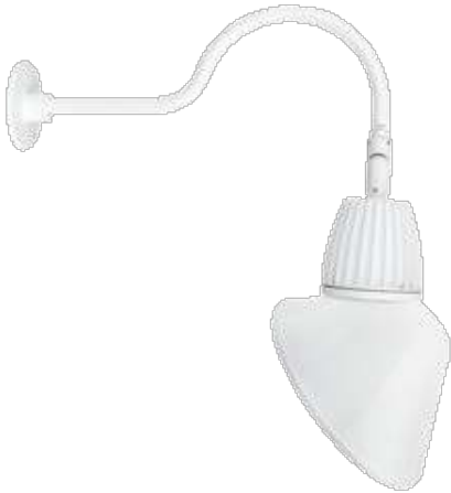
13 & 26 Watt Angled Cone Shade LED Gooseneck Luminaire designed to match the architecture of Main Street storefronts and building perimeters. LED Gooseneck Cone Shade with 24" Goose Arm Style 1.