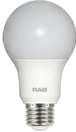
Replace conventional halogen bulbs. Non-dimmable LED, 80 CRI. Color: White Weight: 0.1 lbs