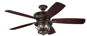
Reversible Walnut Finish Blades