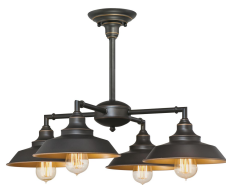
Dual Mounting Option Available