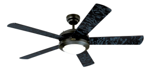
Reversible Marble Finish Blades