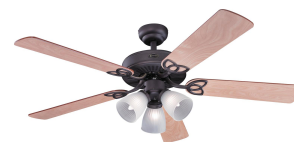
Reversible Light Maple Finish Blades