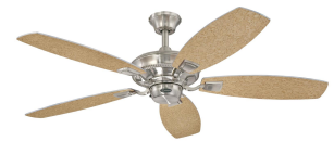
Reversible Bird's Eye Maple Finish Blades