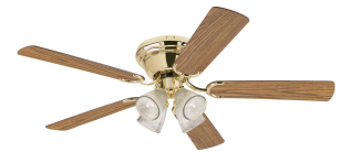
Reversible Oak Finish Blades