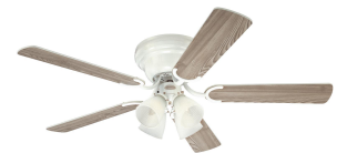
Reversible White Washed Pine Finish Blades