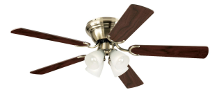
Reversible Walnut Finish Blades