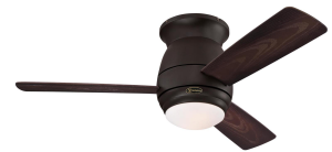
Reversible Mahogany Finish Blades